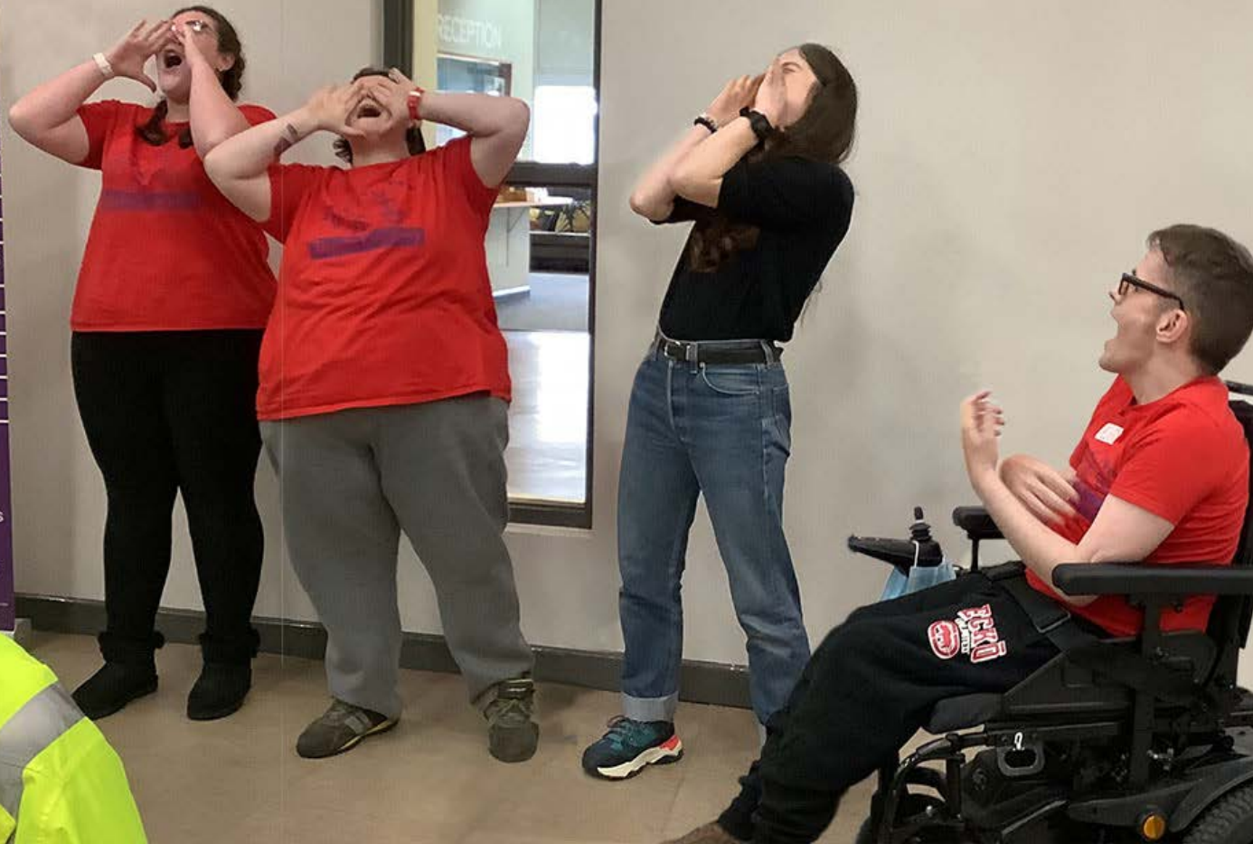
DIY Young Leaders at the Seldom Heard Event