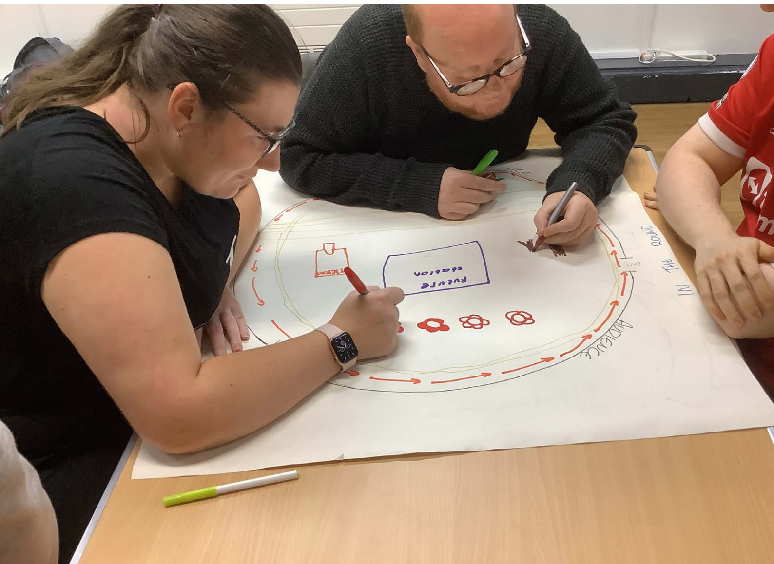
DIY Leaders planning the content for the Gamechangers sessions.