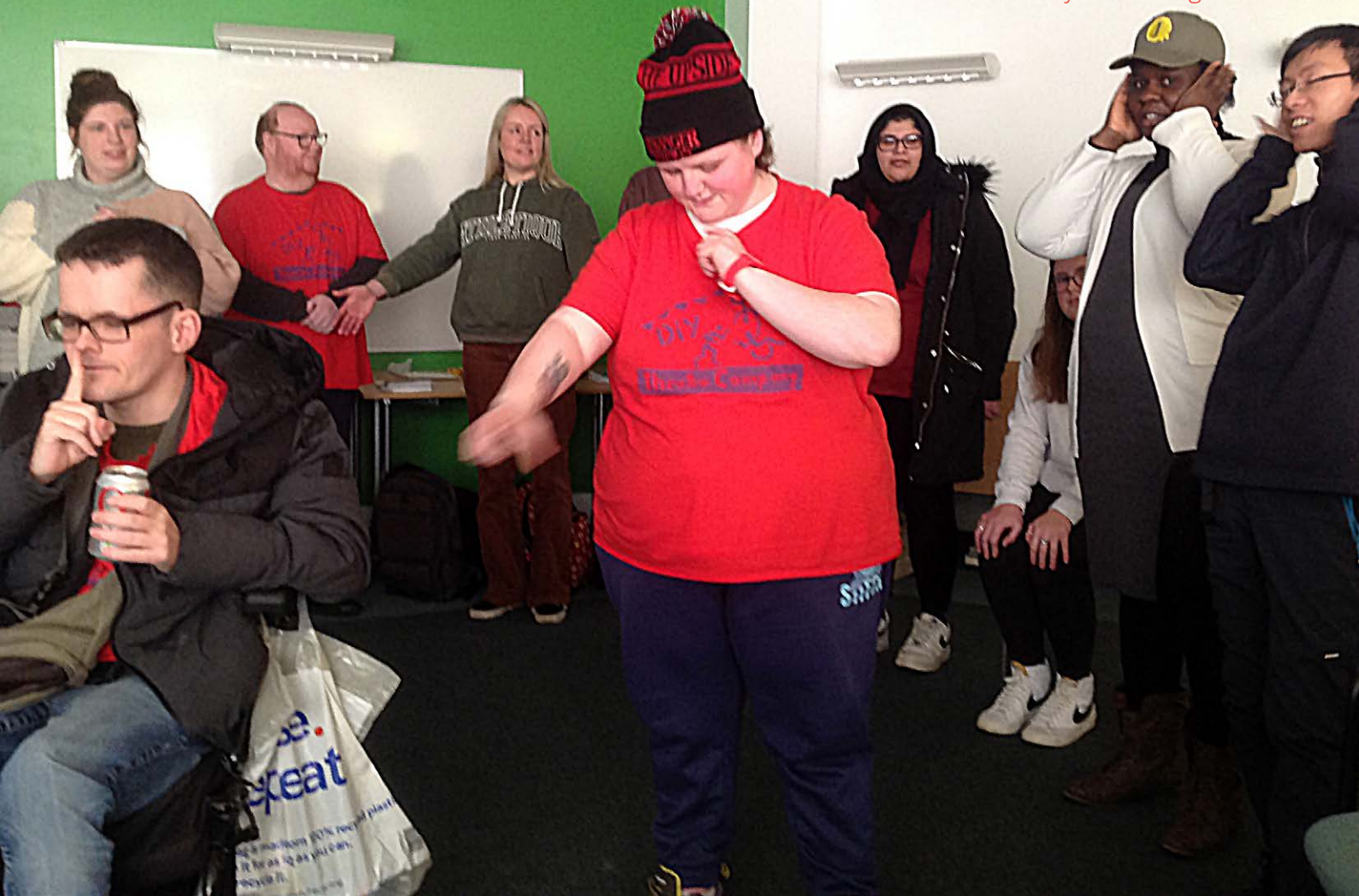
DIY Leaders with students at the University of Salford.