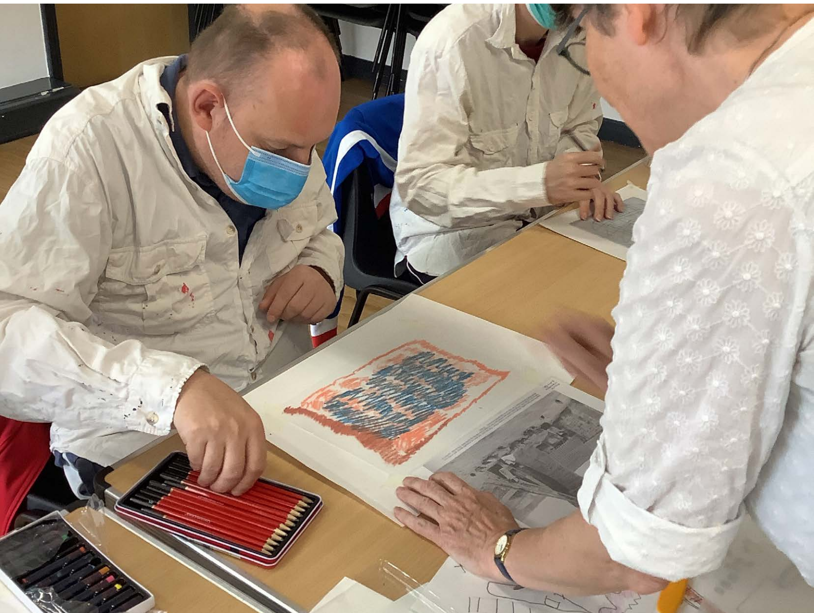
Taking Time to Look & Draw session, June 2022.

During the year DIY ran 5 community education courses that helped learners to develop creative skills.