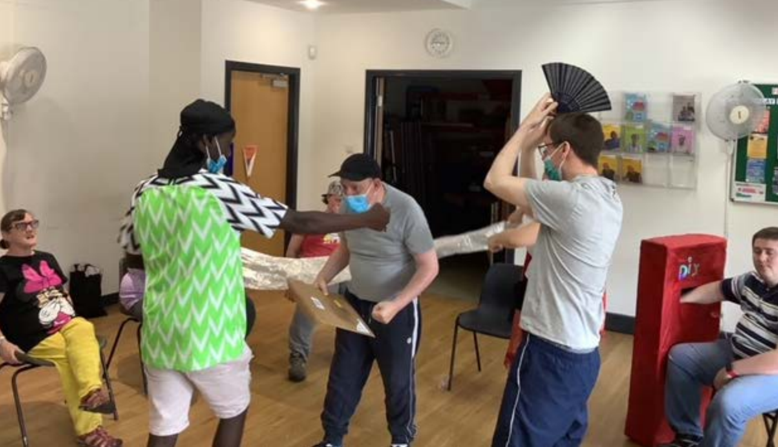
DIY BUDS exploring the theme of 'post' through story-making.