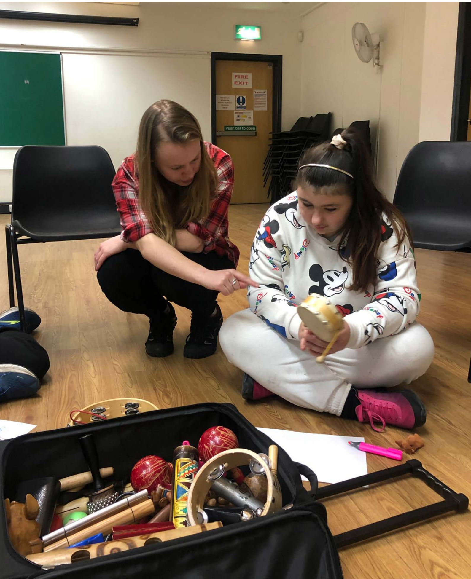
A musician and DIY Young Leader work together to plan a music workshop, Four by Eight project.