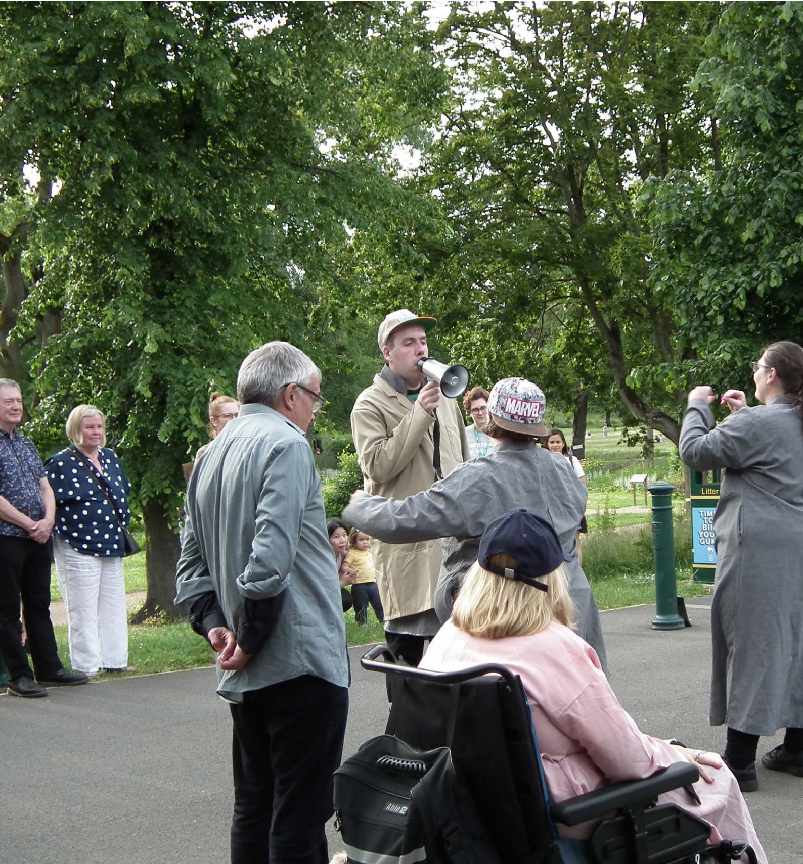
Performance of Looking Back: Facing Forward at the Salford Re:Discovered Event

DIY's productions are based on our own ideas and experiences. We use lots of different art forms and try to make our work as accessible as possible.