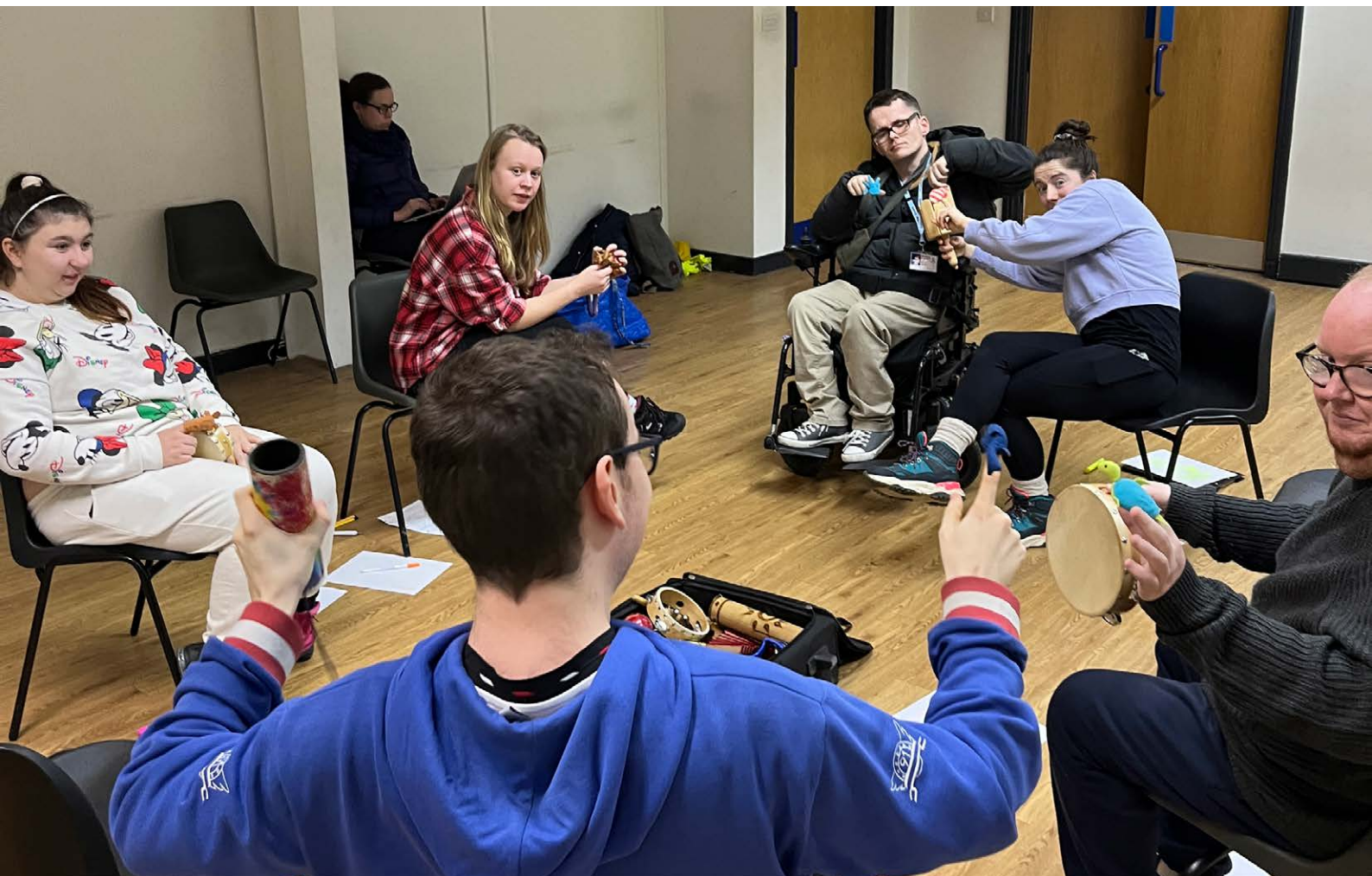
Youth Drama take turns in leading music